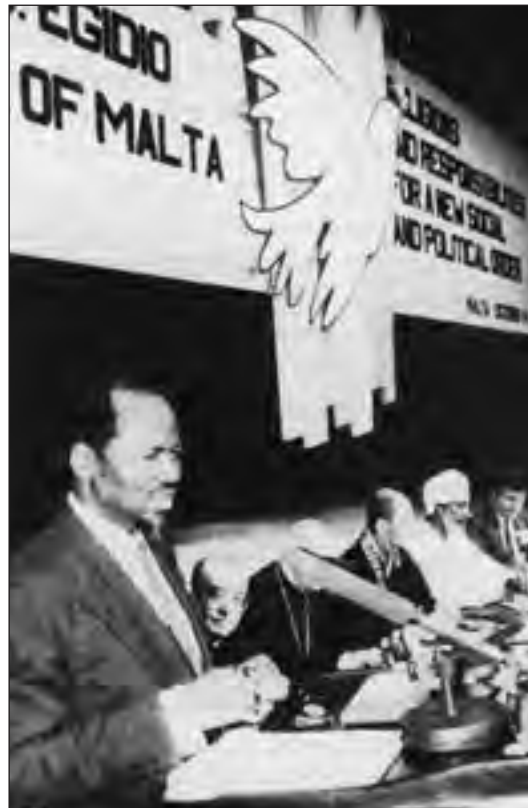
President Chissano addresses the World Peace Forum, sponsored by Sant' Egidio in Malta, October 1991