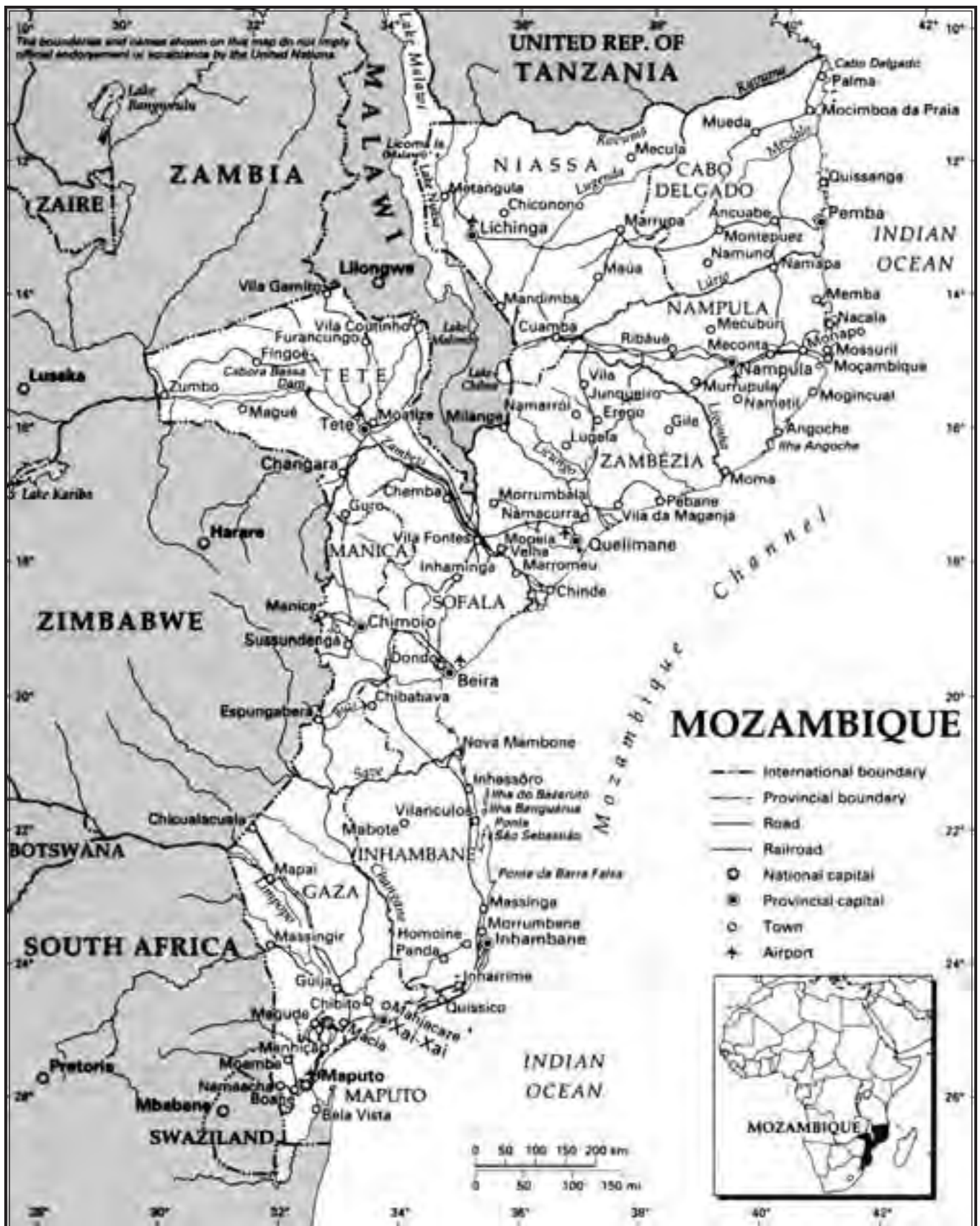
MAP NO. 3706 UNITED NATIONS NOVEMBER 1992