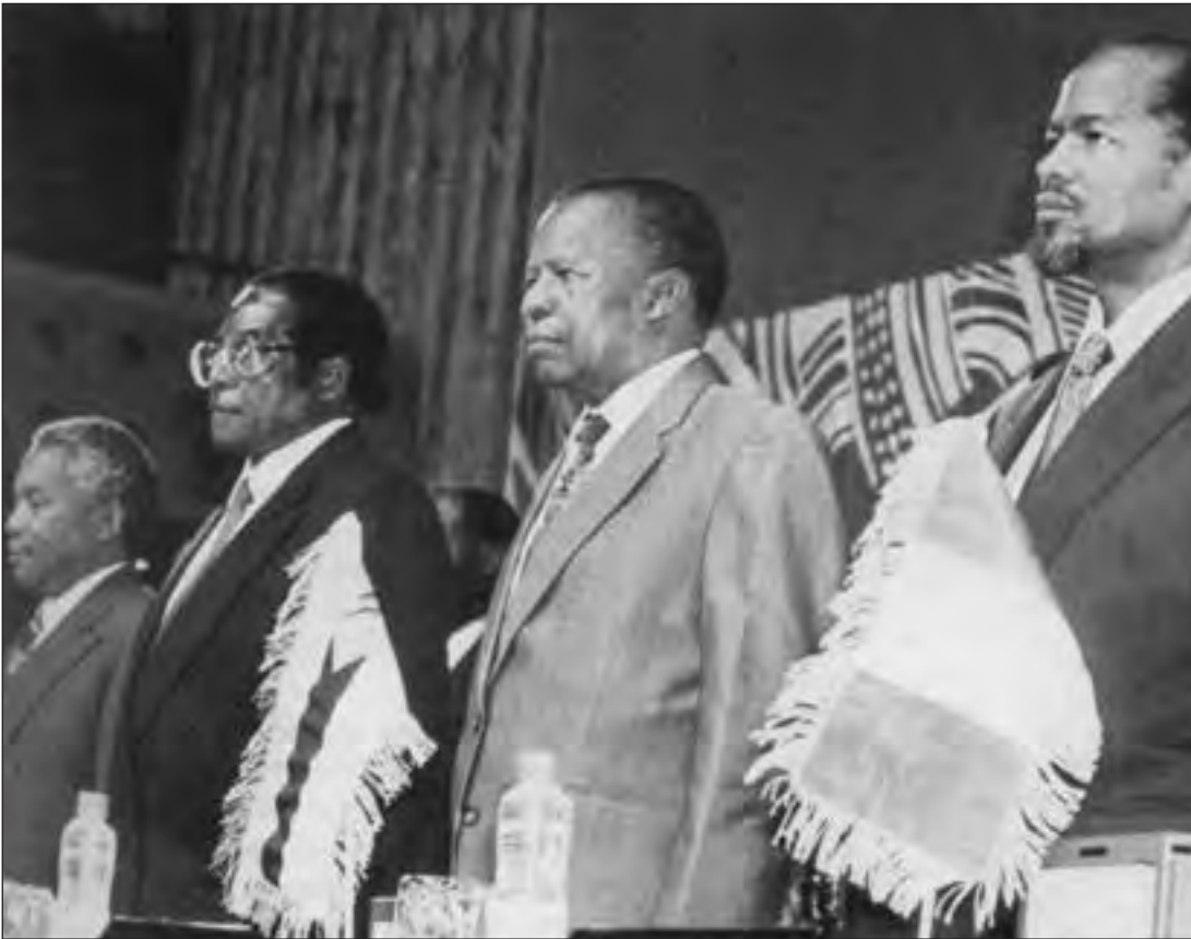
Summit meeting of African heads of state, Harare 1993. From the right Joaquim Chissano (Mozambique), Quett Masire (Botswana), Robert Mugabe (Zimbabwe), Ali Hassan Mwinyi (Tanzania)

separating apartheid South Africa from independent black Africa was severely threatened. With increasing international calls for economic sanctions against the apartheid regime and growing militancy from the exiled African National Congress (ANC), South Africa felt increasingly under siege. It responded with a systematic policy of regional economic destabilisation. On the one hand, this was intended to raise the cost to the Front Line States of supporting the ANC. On the other, it aimed to force these countries into closer economic co-operation with South Africa, thus bolstering its security and legitimacy.