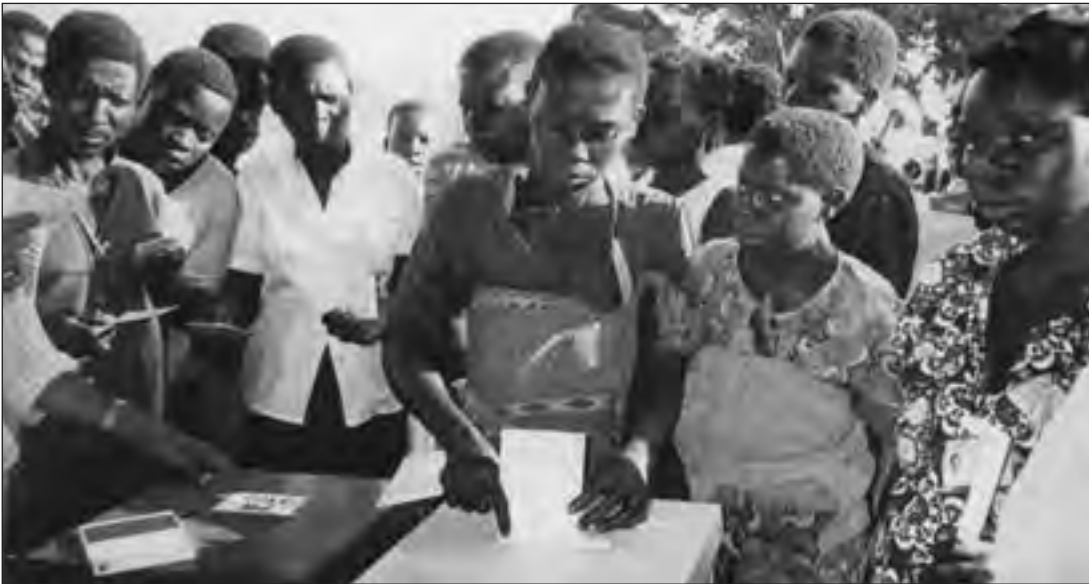
Women voting in the 1994 elections, Inlugo village, Zambézia Province

saw Chissano re-elected ahead of Dhlakama and other candidates by a slim majority of total votes cast. On 14 November, some days after the United Nations certified the elections 'free and fair', Dhlakama formally conceded defeat. A new, all Frelimo government was installed in late December.