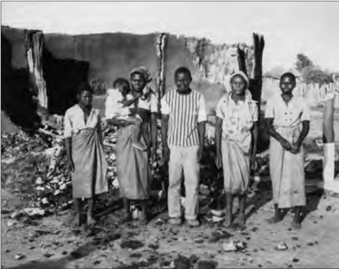
A family home burned down by Renamo, Gaza Province, 1989